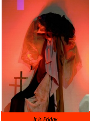
And I stand at the foot of the cross